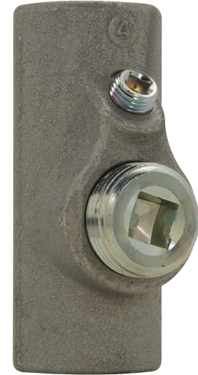
Vertical or horizontal female