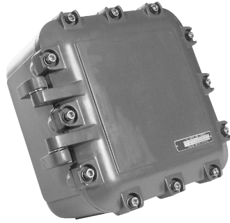
EJB 241 M1