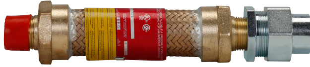
ECLK (ECGJH provided with UNF female union – male connection at one end, female connection at one end)

2 1/2" to 4" – stainless steel construction only