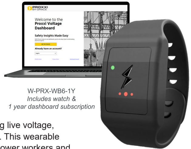
W-PRX-WB6-1Y Includes watch & 1 year dashboard subscription

Proxxi by Grace provides real-time alerts to workers approaching live voltage, adding an extra layer of security for when the unexpected occurs. This wearable voltage-detecting wristband, companion app and dashboard empower workers and management with actionable data to prevent injuries and fatalities, enhancing overall safety and productivity.