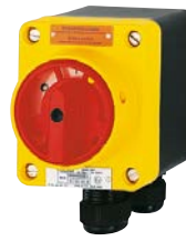
3-pole EMERGENCY STOP