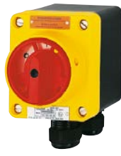
3-pole EMERGENCY STOP